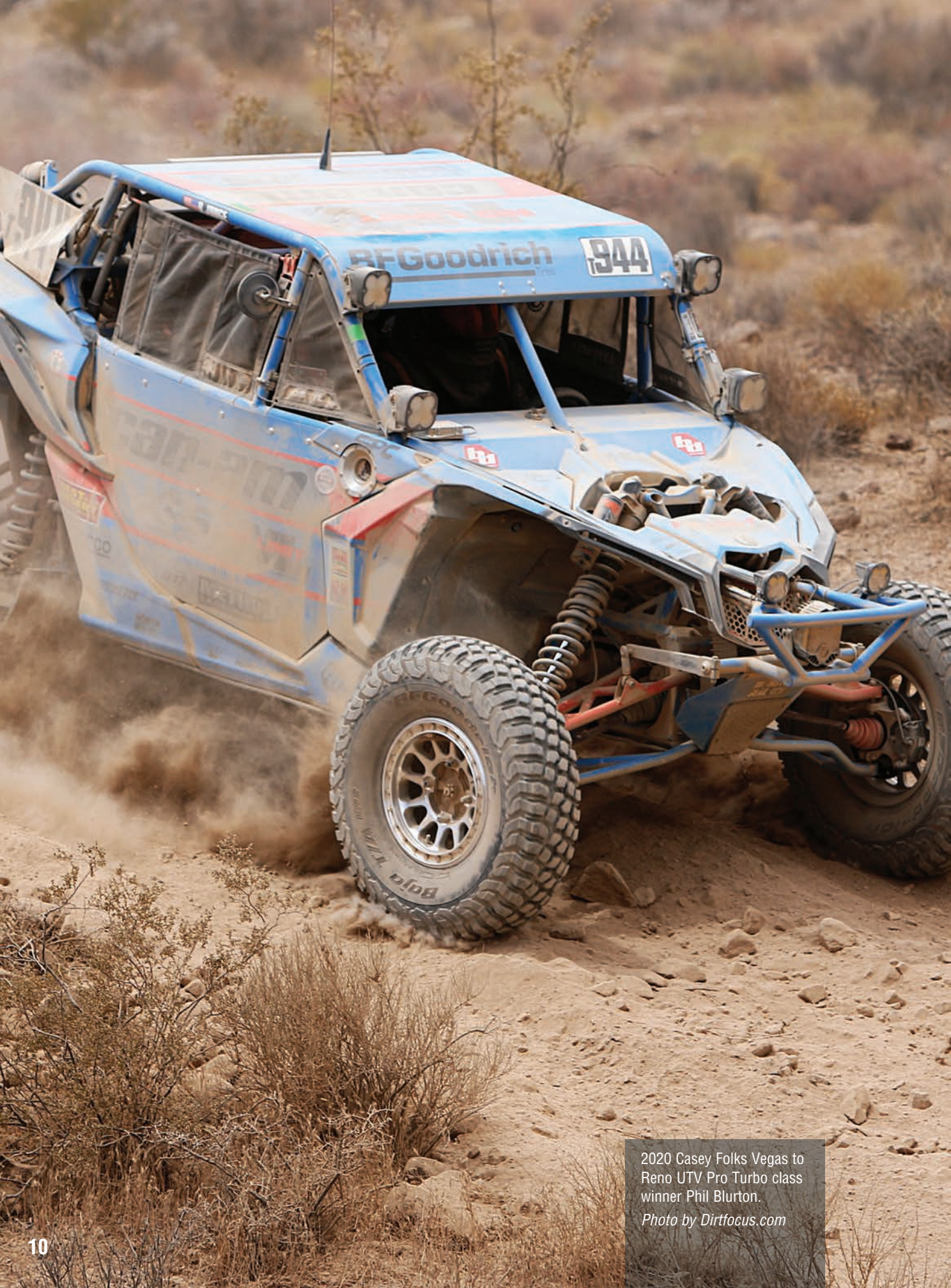
2020 Casey Folks Vegas to Reno UTV Pro Turbo class winner Phil Blurton.