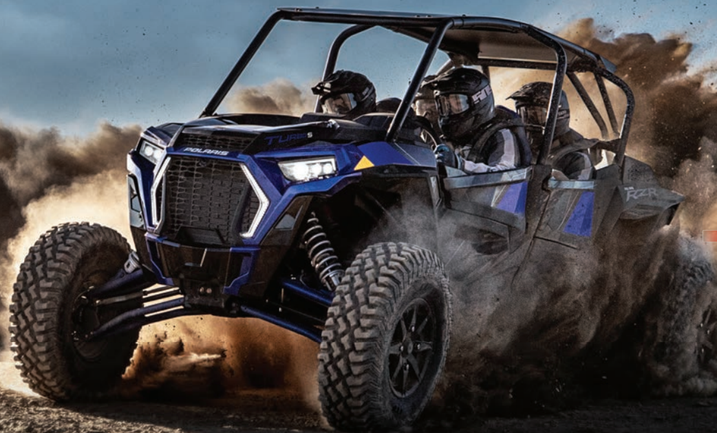
ALL-NEW RZR XP® 4 TURBO S

Unrelenting performance without boundaries, Polaris® RZR® stands alone. Our passion for the off-road is only surpassed by our pursuit for the ultimate riding experience. RZR® is a driving force, always on the throttle, and recognized as the world's undisputed leader for extreme-terrain performance and off-road adrenaline. See your local dealer or visit RZR.POLARIS.COM for more information.