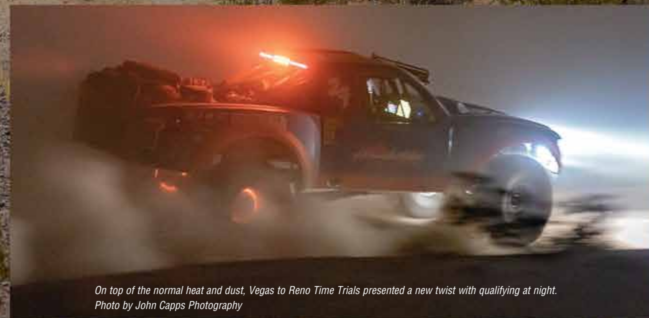
On top of the normal heat and dust, Vegas to Reno Time Trials presented a new twist with qualifying at night.