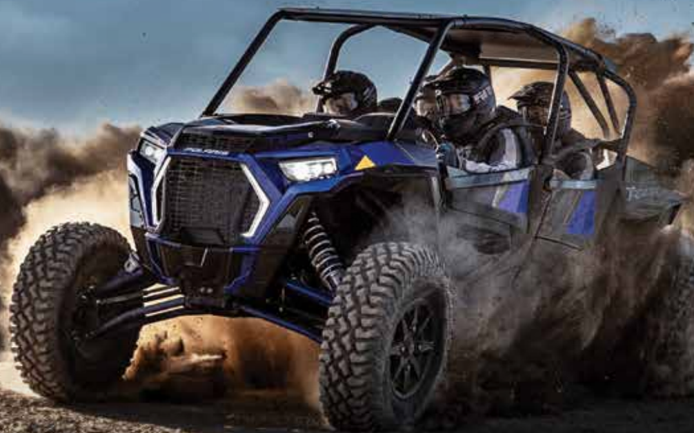
ALL-NEW RZR XP® 4 TURBO S

Unrelenting performance without boundaries, Polaris® RZR® stands alone. Our passion for the off-road is only surpassed by our pursuit for the ultimate riding experience. RZR® is a driving force, always on the throttle, and recognized as the world's undisputed leader for extreme-terrain performance and off-road adrenaline. See your local dealer or visit RZR.POLARIS.COM for more information.